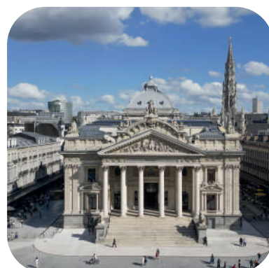
BRUSSELS OLD STOCK MARKET (EX BOURSE / BEURS)

Discover this very atypical place, you won't regret it