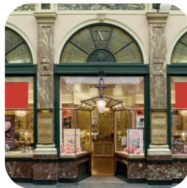
NEUHAUS CHOCOLATE WORKSHOP

Our tournament symbol, there's a reason why