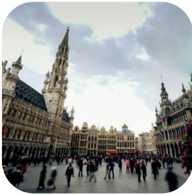
THE GRAND PLACE

Belgium may be a small country, but it's filled with treasures waiting to be discovered! To ensure you have a pleasant experience during your stay in our capital city, we've put together a selection of must-see attractions that you absolutely shouldn't miss before you leave.