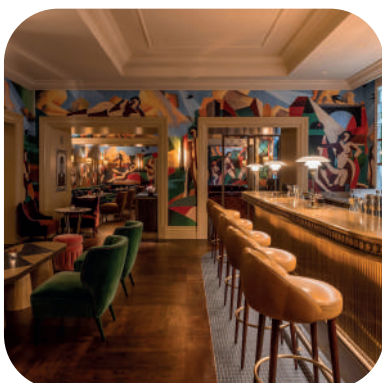
MAGRITTE BAR AT AMIGO HOTEL

Of course you cannot skip the 'Belgian' step during your stay in Belgium